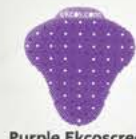
Purple Ekcoscreen Berry Fragrance 60 days PLUS EKS-1P