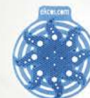
Blue Power Screen Fresh Fragrance 30 day PWR-3B