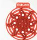
Red Power Screen Melon Fragrance 30 day PWR-10R