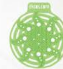
Green Power Screen Apple Fragrance 30 day PWR-2G