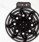
Black Power Screen Mint Fragrance 30 day PWR-7BK