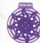
Lavender Power Screen Lavender Fragrance 30 day PWR-12P