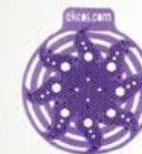
Purple Power Screen Berry Fragrance 30 day PWR-1P