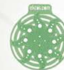
Green Pine Power Screen Pine Fragrance 30 day PWR-9G