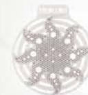
Clear Power Screen Tropical Fruit Fragrance 30 day PWR-6C